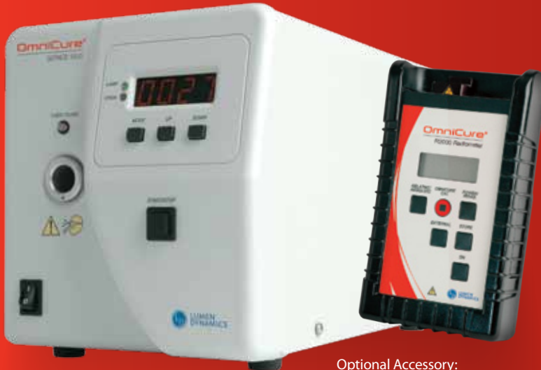
Optional Accessory: OmniCure® R2000 Radiometer

To accommodate various customer needs, the OmniCure® S1500 can be used with four different light delivery options. Ideally used with a multi-legged High Power Fiber Light Guide to cure multiple sites with a single light source, Single-Legged, Liquid-Filled and Fiber Light Guides are also available.